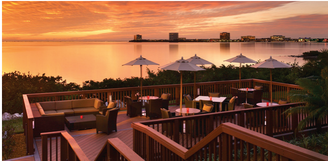
View from the Grand Hyatt on the Courtney Campbell Causeway